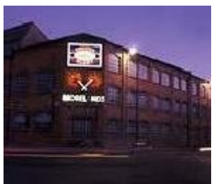
The former lights in action!