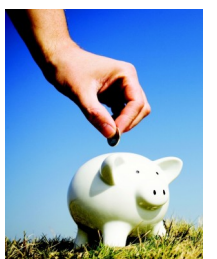
Helping you make every penny help!

Info@buyingsupport.co.uk or 0845 555 33 44 or visit www.buyingsupport.co.uk