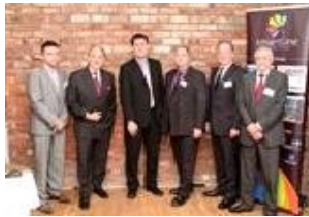
Bringing the borough together.