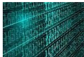
High-speed Broadband: Coming to a place near you thanks to a new BID

Gloucestershire First have been successful in gaining partnership with Herefordshire in obtaining funding to expand high speed broadband to many areas in the Forest of Dean. Please watch this space for further updates in the future.