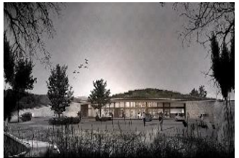
Support for local producers: Artist mock up of how the new Motorway Service Area may look

Omega Resource Group will be hosting an Agency Workers Directive Seminar on 25 th January 2011 , why not attend and find out how the new regulations will affect your business?