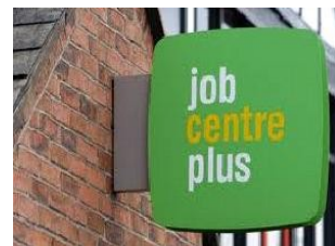
Job Centre Plus: getting ready for business

Improvements to Business signage kindly sponsored by Cheltenham Borough Council for both Kingsditch and Lansdown is currently ongoing. Please look out for an update in our next edition.